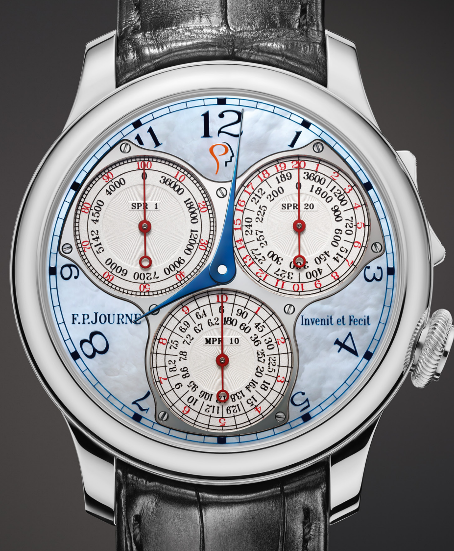
Centigraphe Souverain ICM 2016 Ref. CT

2016_ A unique Centigraphe Souverain with a blue mother-of-pearl dial, discreetly bearing the Paris Brain Institute logo at 12 o'clock, is auctioned at a charity gala held at the Conciergerie in Paris. The hammer fell at € 120,000, a sum that will also be entirely donated to the Institute.