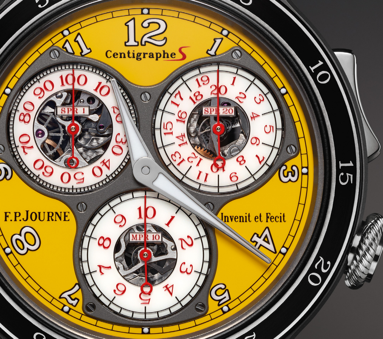
Centigraphe Ref. CTS2