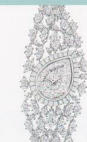
HARRY WINSTON Legacy by Harry Winston