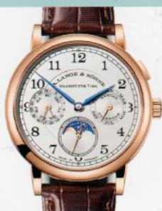
A. LANGE & SÖHNE 1815 Annual Calendar