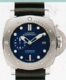
PANERAI Luminor Submersible 1950 BMG- TECH 3 Days Automatic - 47mm PAM692