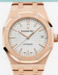
AUDEMARS PIGUET Royal Oak Frosted Gold