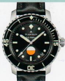
BLANCPAIN Tribute to Fifty Fathoms MIL-SPEC