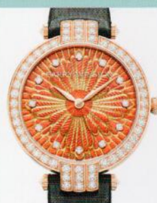
HARRY WINSTON Premier Delicate Silk Automatic 36mm