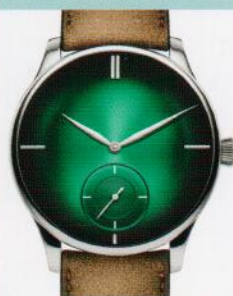
H. MOSER & CIE. Venturer Small Seconds XL Purity Cosmic Green