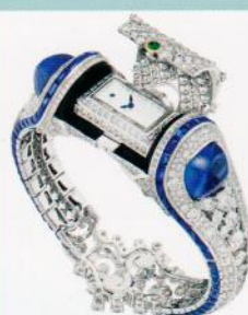
VAN CLEEF & ARPELS Heure Marine watch