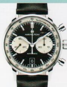
HAMILTON Intra-Matic 68