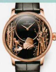
JAQUET DROZ Loving Butterfly Automaton