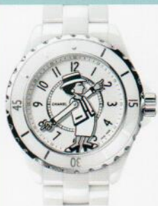
CHANEL Mademoiselle J12