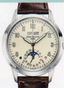
PATEK PHILIPPE Ref. 5320