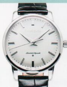
GRAND SEIKO The Re-Creation of the First Grand Seiko