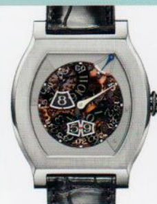
F.P. JOURNE Vagabondage III