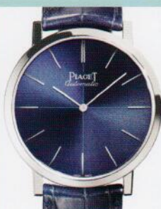
PIAGET Altiplano 60 th Anniversary Self-Winding 43mm