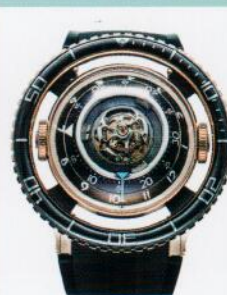
MB&F HM7 Aquapod

第六屆「年度好表游絲十大」腕表選舉已經塵埃落定，一如往年，我們編輯部嚴選了不同組別的入圍腕表，交由專業評審及讀者投票，最後計算出每個組別的三強。以下就是獲獎的年度好表，值得在這裡站台，接受大家的歡呼加冕。