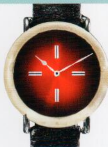
H. MOSER & CIE. Swiss Mad Watch