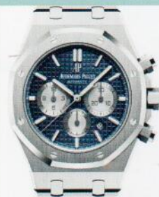
AUDEMARS PIGUET Royal Oak Chronograph