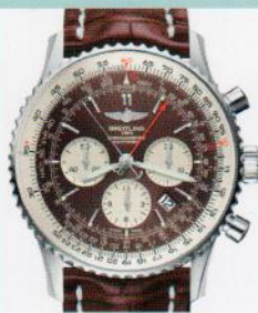
BREITLING Navitimer Rattrapante