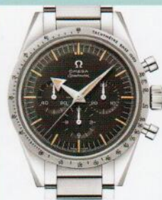
OMEGA The Speedmaster 60 th Anniversary Limited Edition 38.6mm