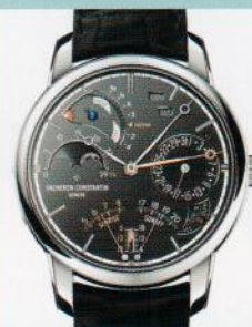
VACHERON CONSTANTIN Les Cabinotiers Celestia Astronomical Grand Complication 3600