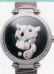
CARTIER Panthere Joueuse