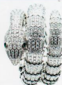
BVLGARI Serpenti High Jewellery