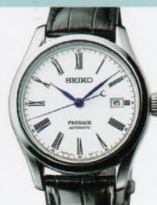
SEIKO Presage Enamel Automatic