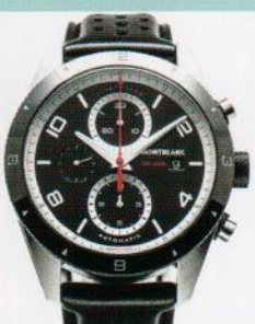
MONTBLANC TimeWalker Chronograph Automatic