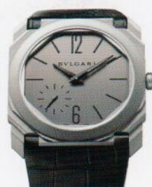
BVLGARI Octo Finissimo Automatic