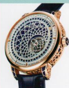
JAEGER-LECOULTRE Hybris Artistica mysterieuse