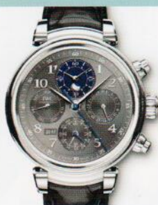
IWC Da Vinci Perpetual Calendar Chronograph